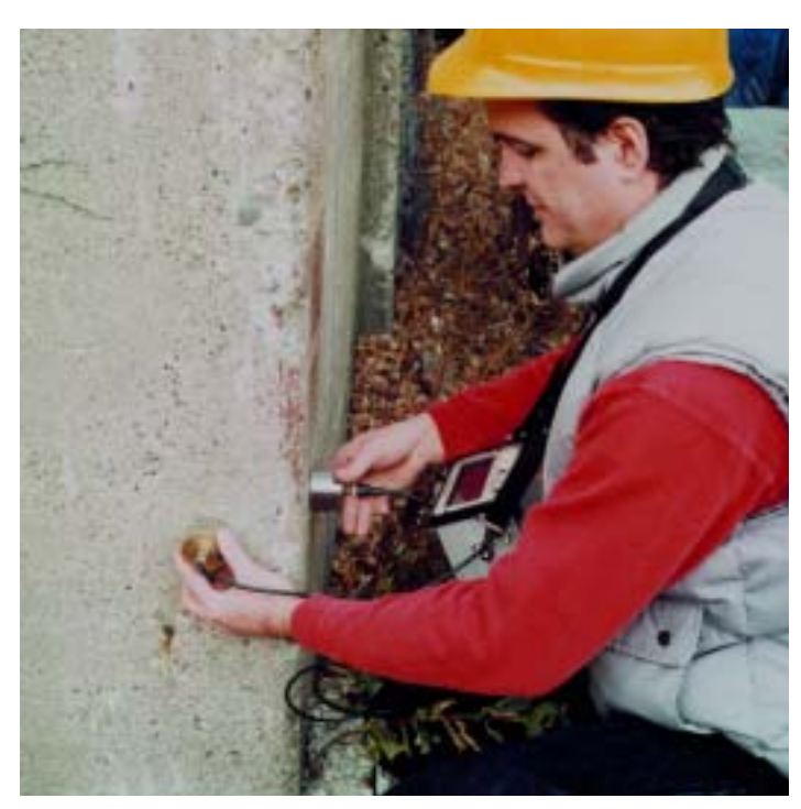
Semi-direct method of checking concrete for flaws.