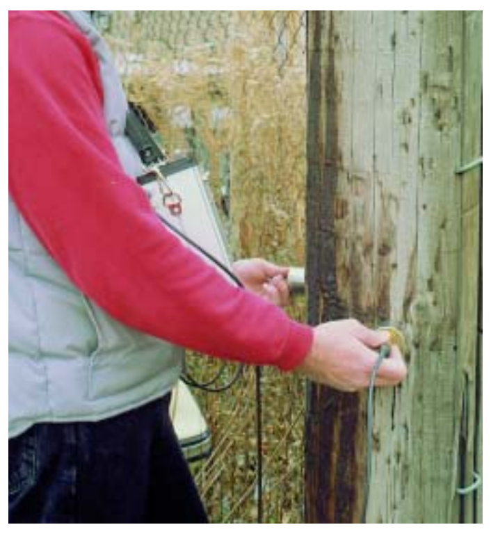
Direct method used in detecting decay and rot in wood ...