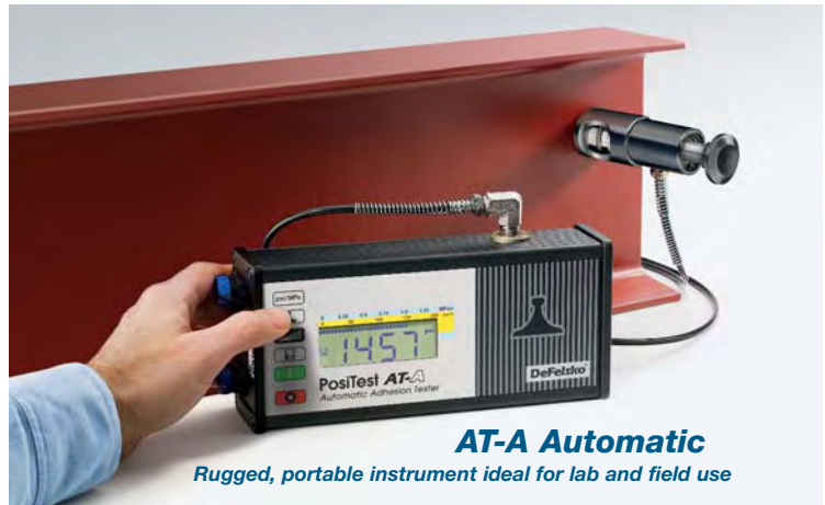
AT-A Automatic Rugged, portable instrument ideal for lab and field use